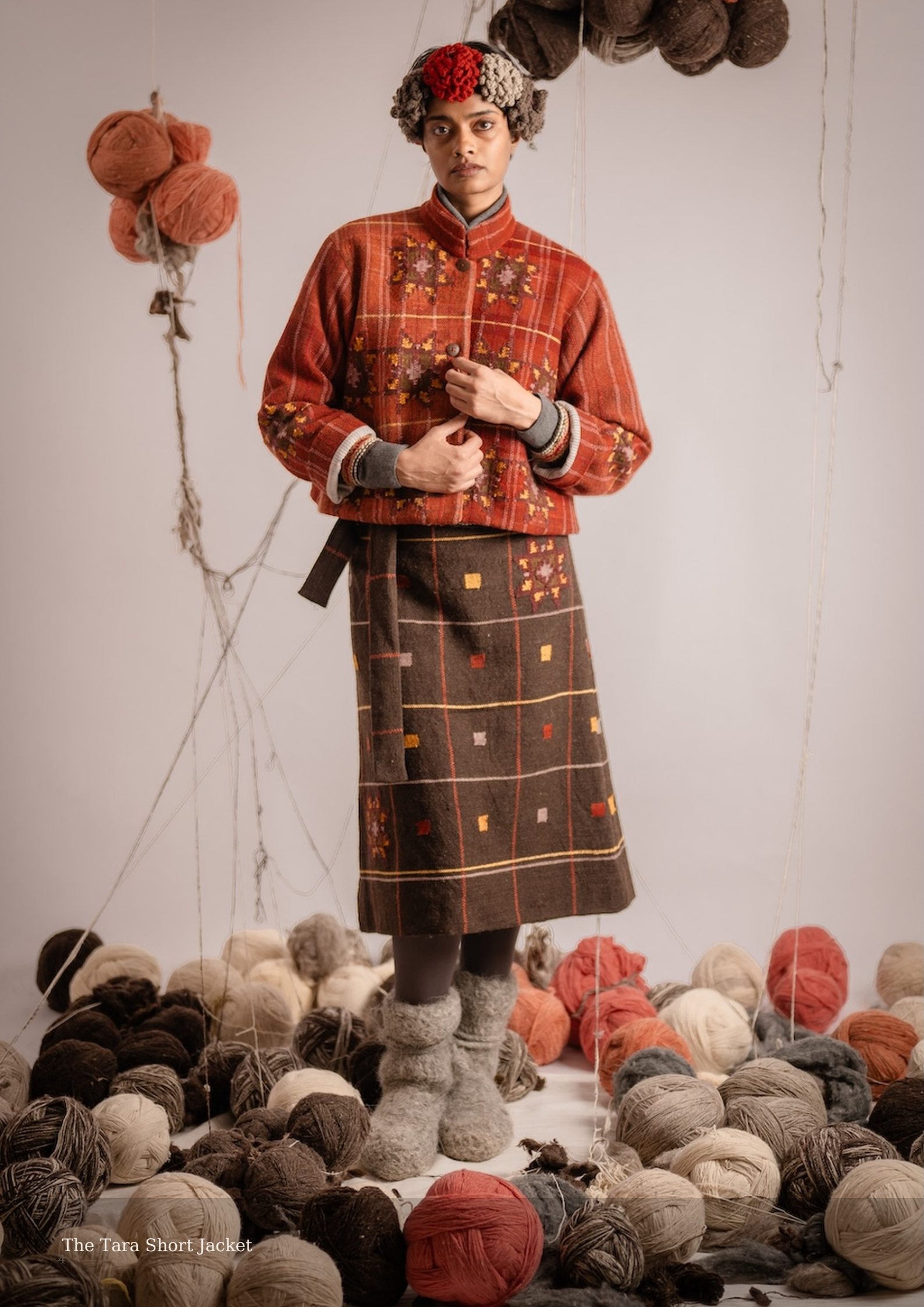
The Tara Short Jacket