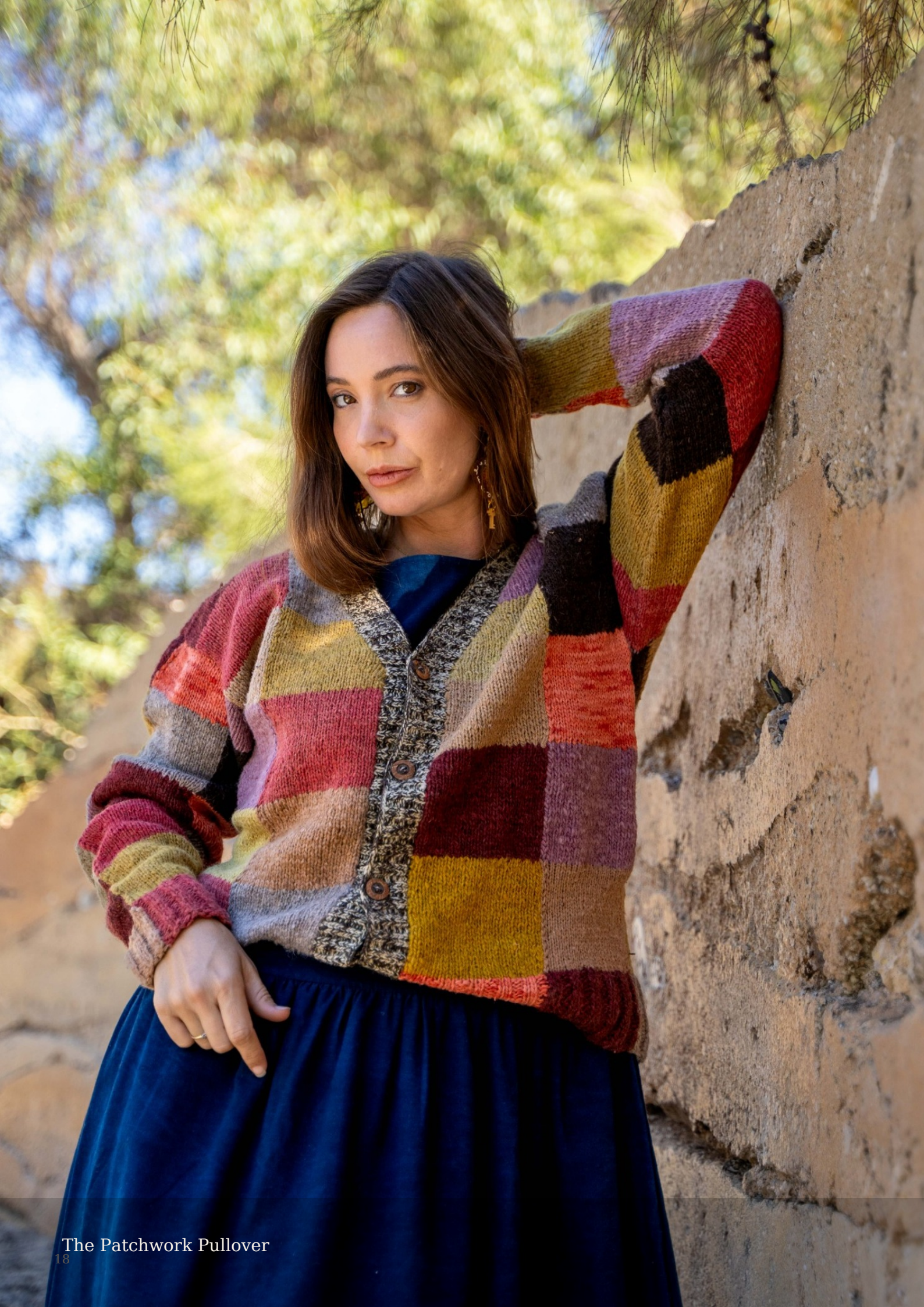
The Patchwork Pullover