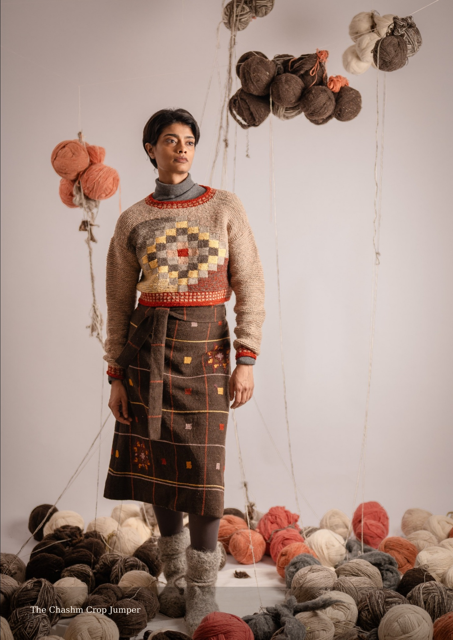
The Chashm Crop Jumper