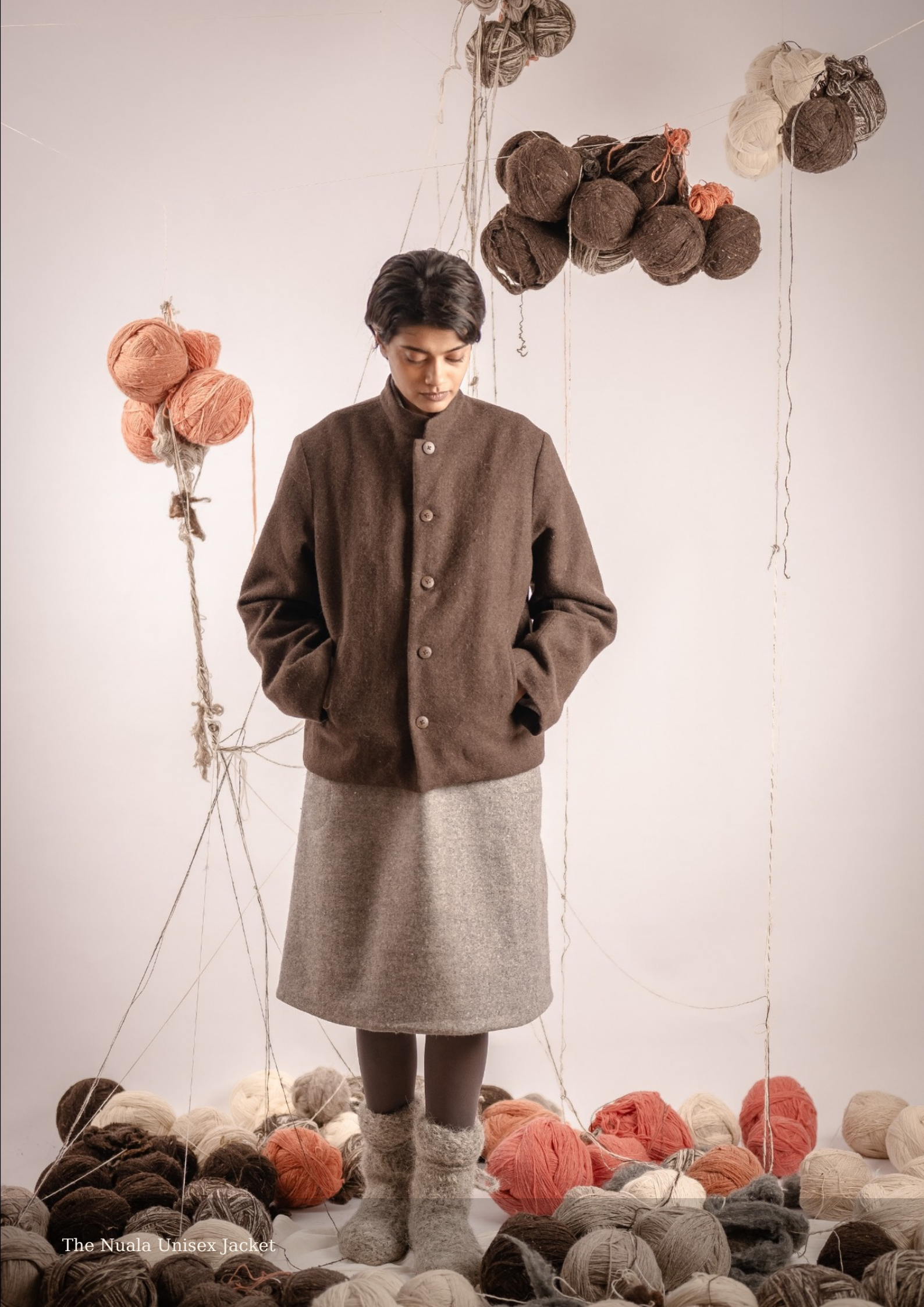
The Nuala Unisex Jacket