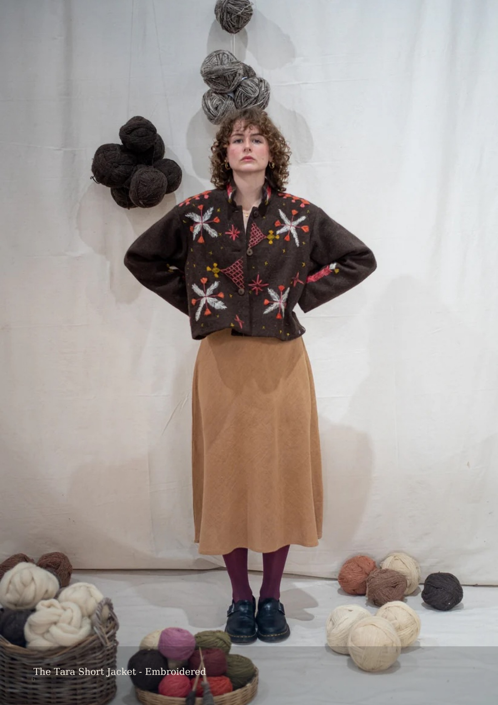
The Tara Short Jacket - Embroidered