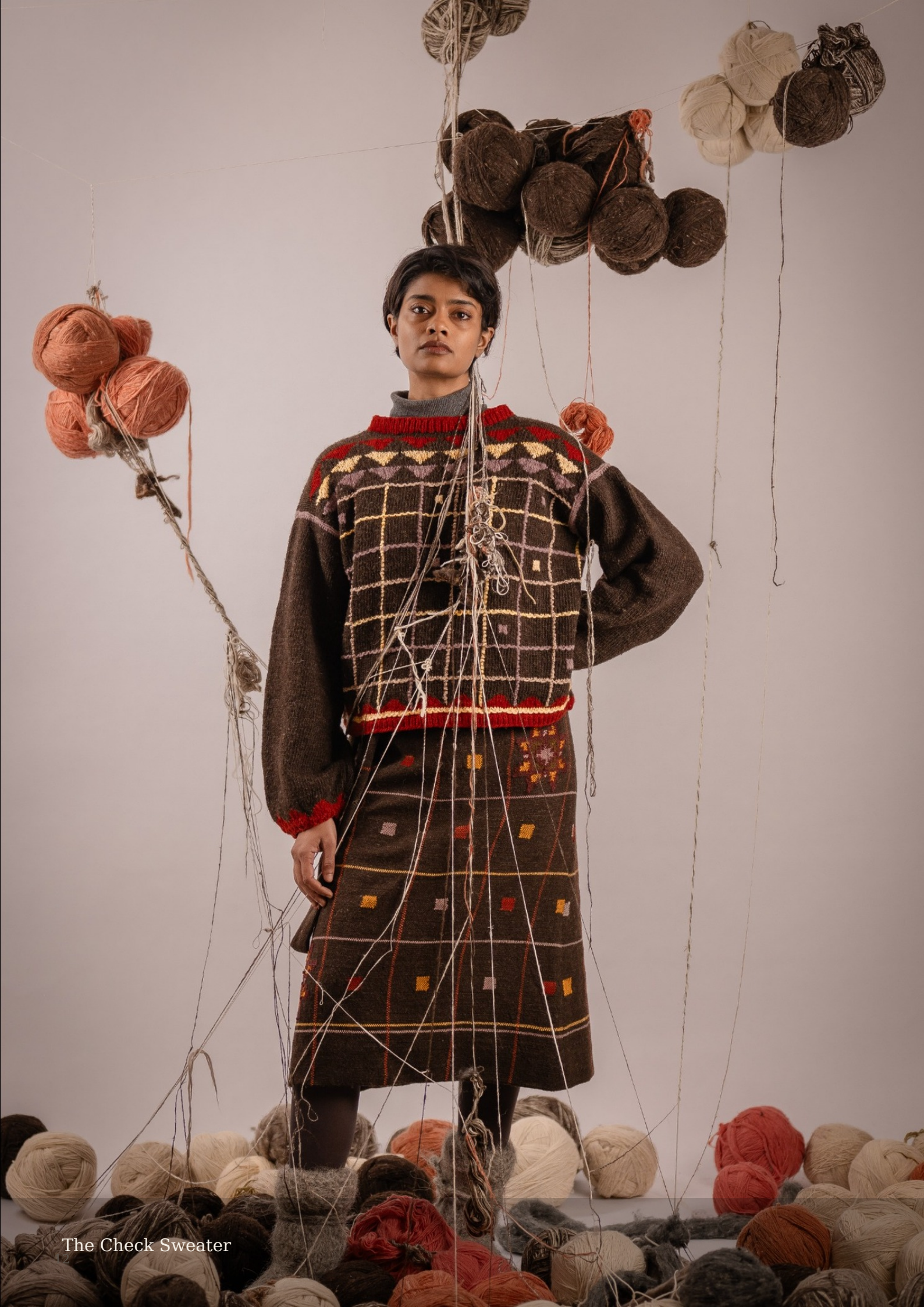
The Check Sweater