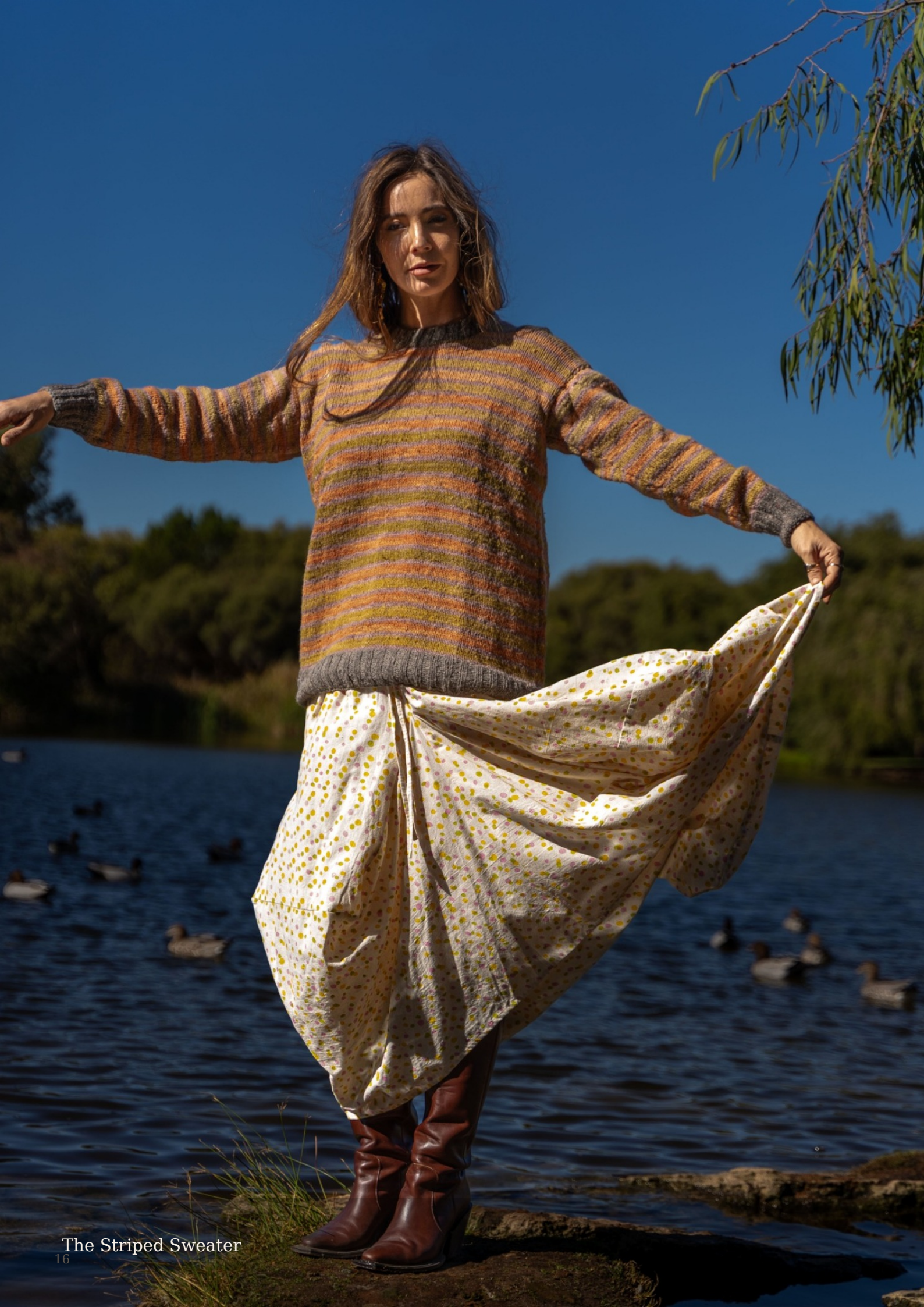
The Striped Sweater