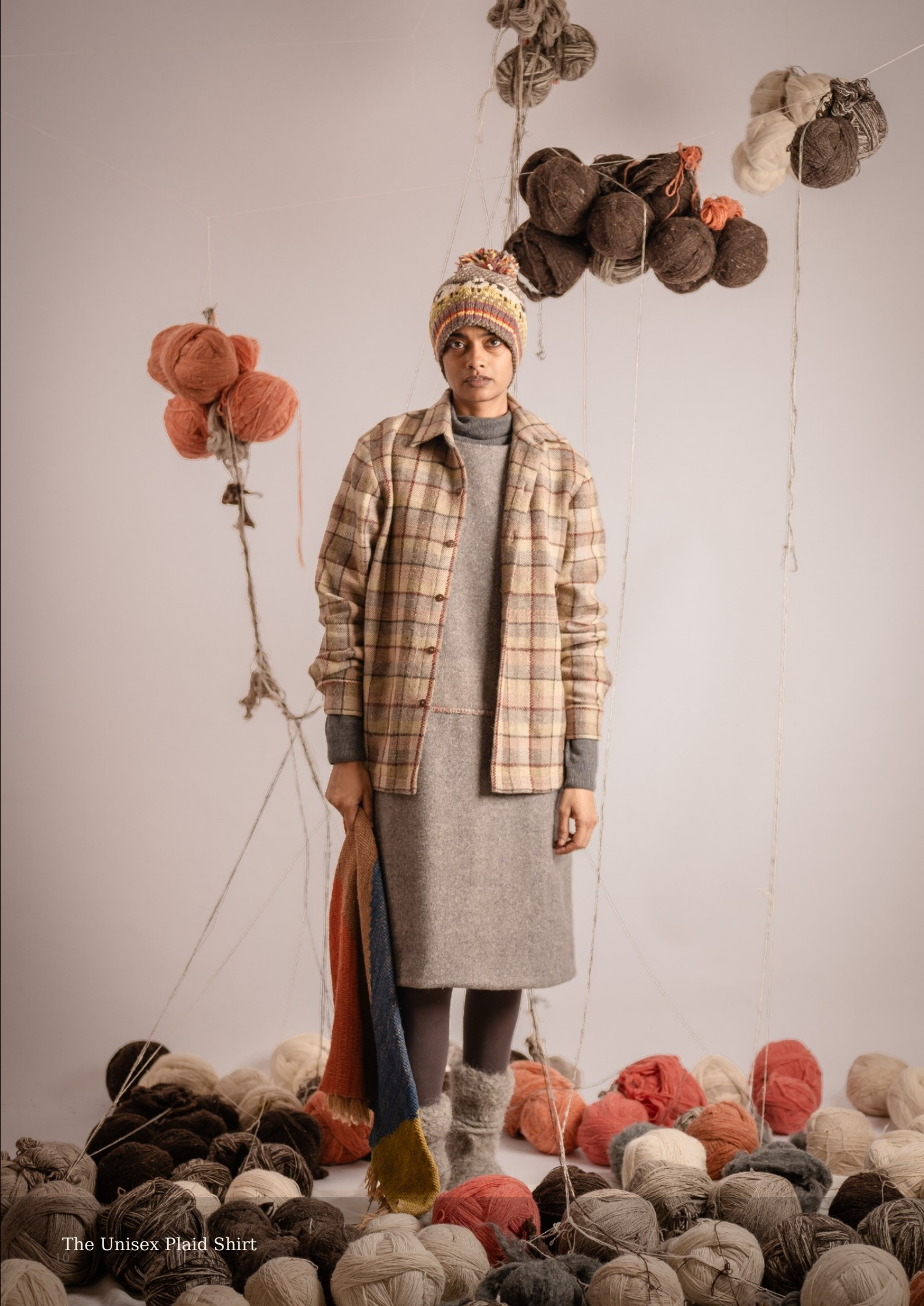
The Unisex Plaid Shirt